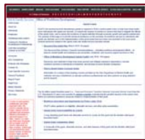
OWD's Opioid Grants Web Page

http://ifs.ohio.gov/owd/WorkforceProf/OpioidGrants.stm