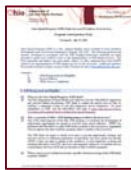
FAQ and SOR Funding Restrictions document