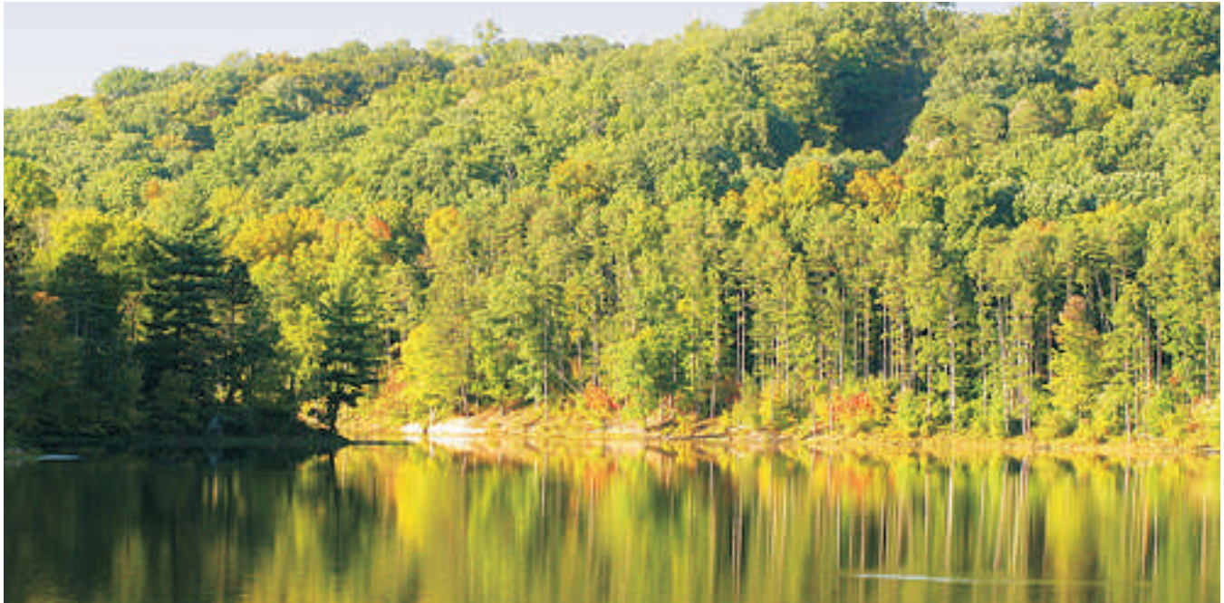
Lake Hope State Park, Vinton County.