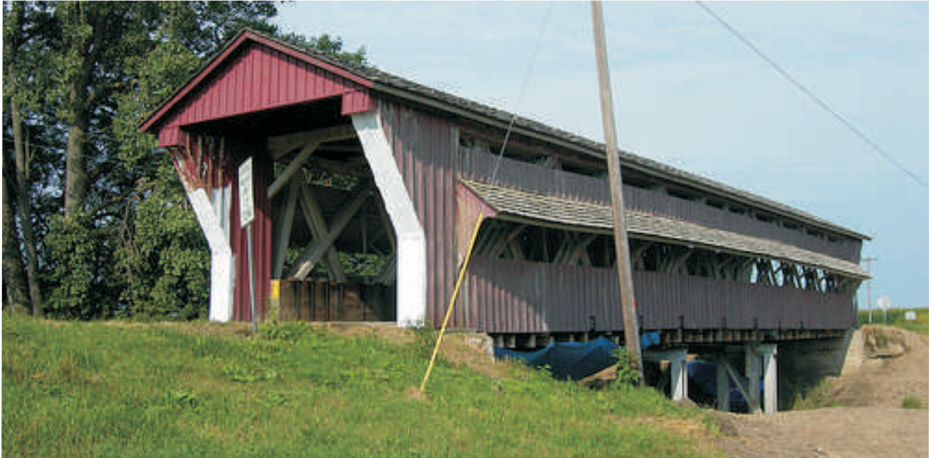
Winget Road Covered Bridge in southeastern Union County.