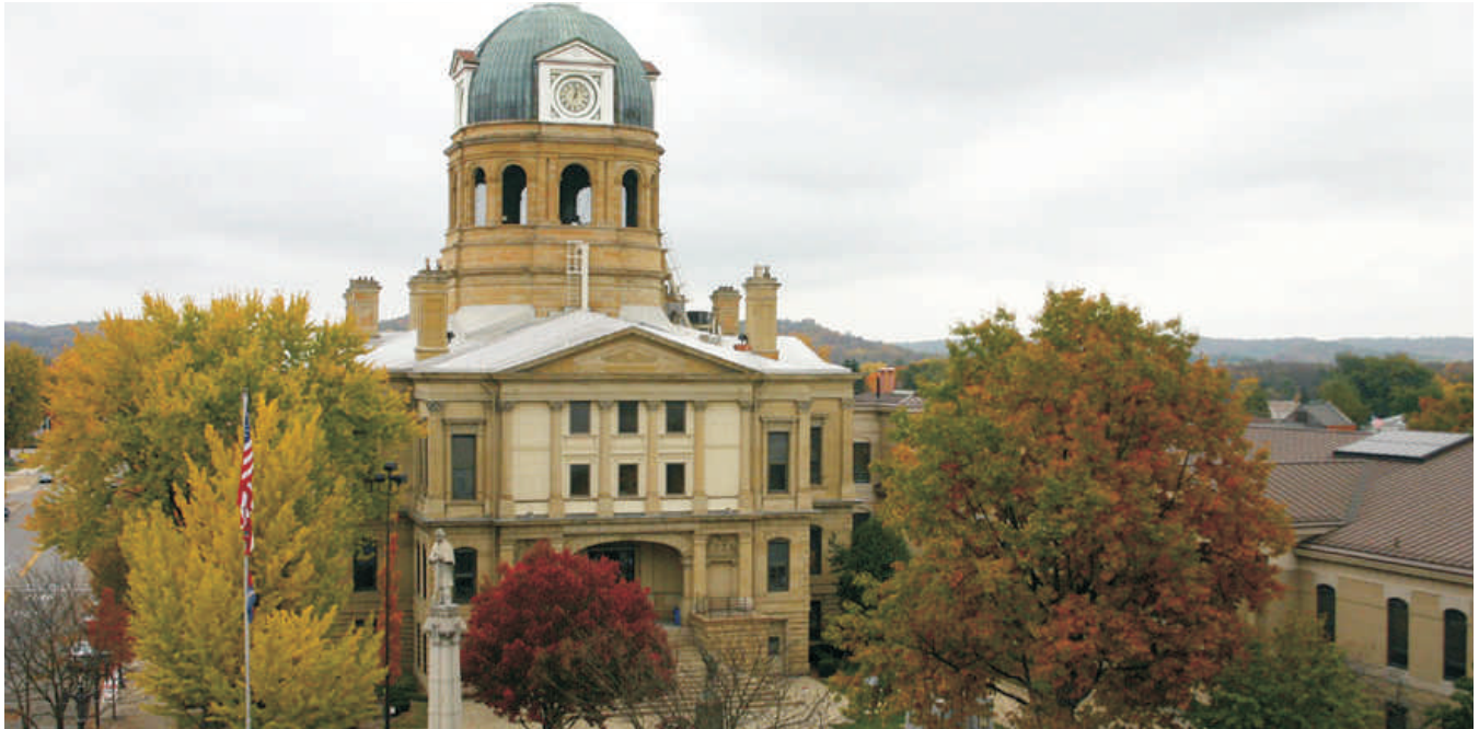
Tuscarawas County Courthouse, New Philadelphia