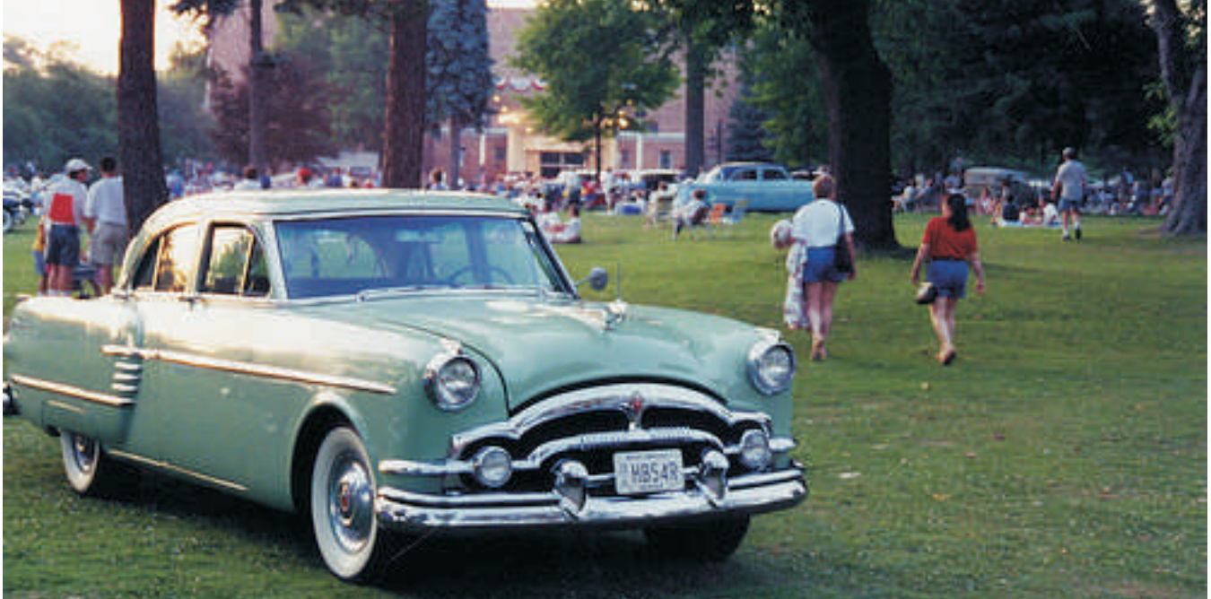
Packard Museum Car Show at the Packard Music Hall, Warren, Ohio