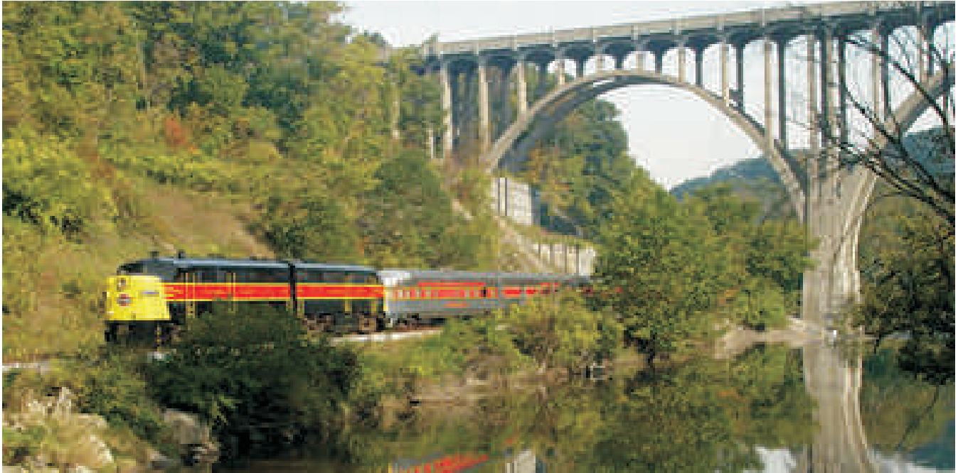
Cuyahoga Valley National Park