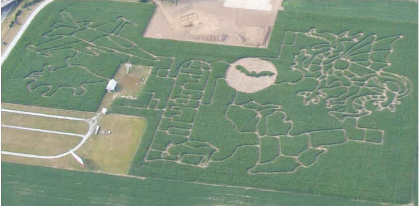
Lost Land Corn Maze, Sidney