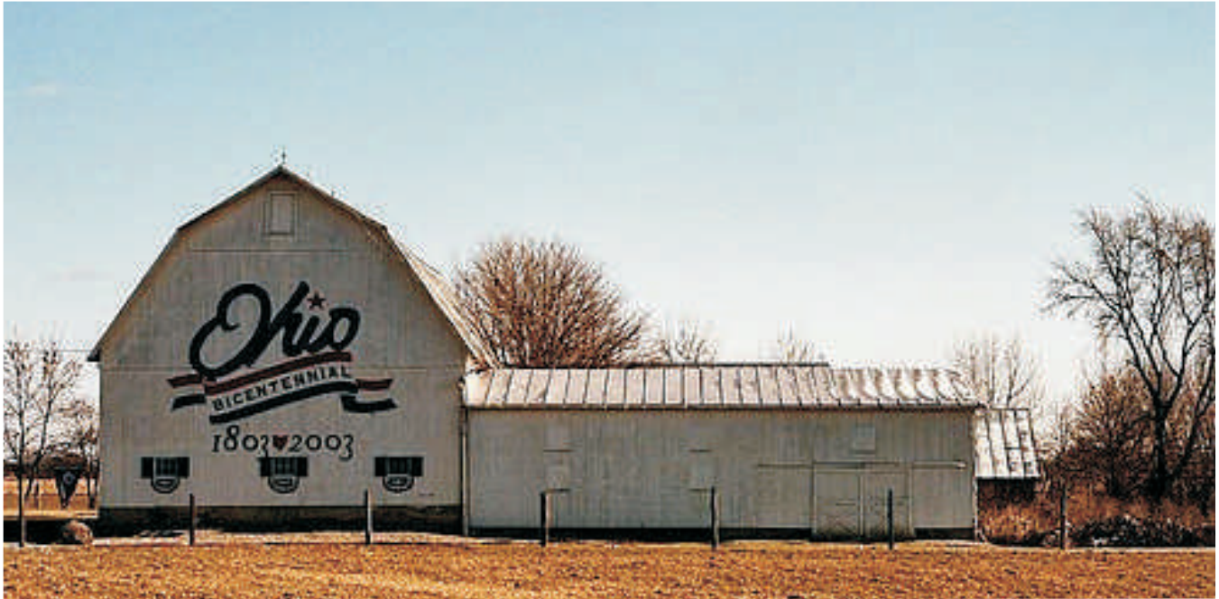
Barn on 7595 West State Route 12 east of Fostoria.