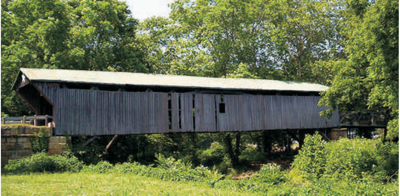
The Otway Covered Bridge, Brush Township.