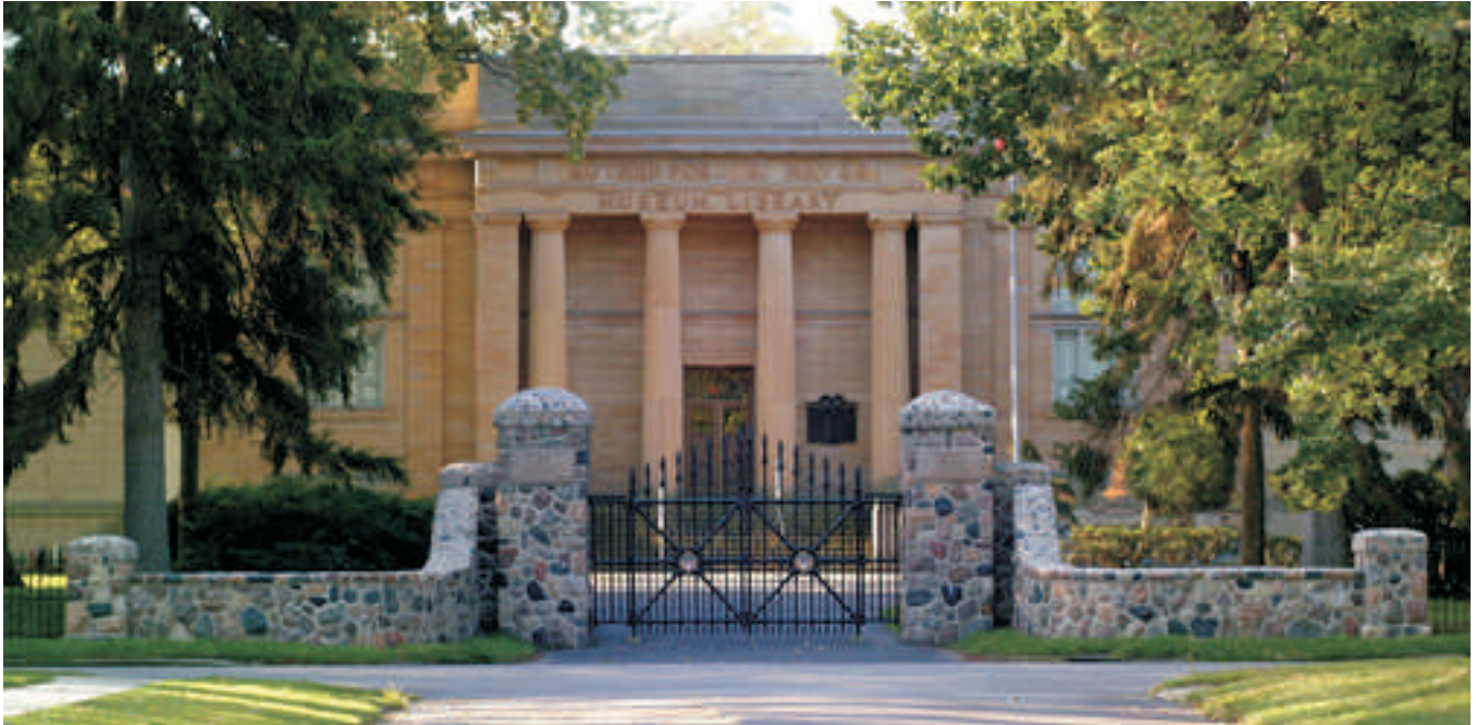
Rutherford B. Hayes Presidential Center, Fremont.