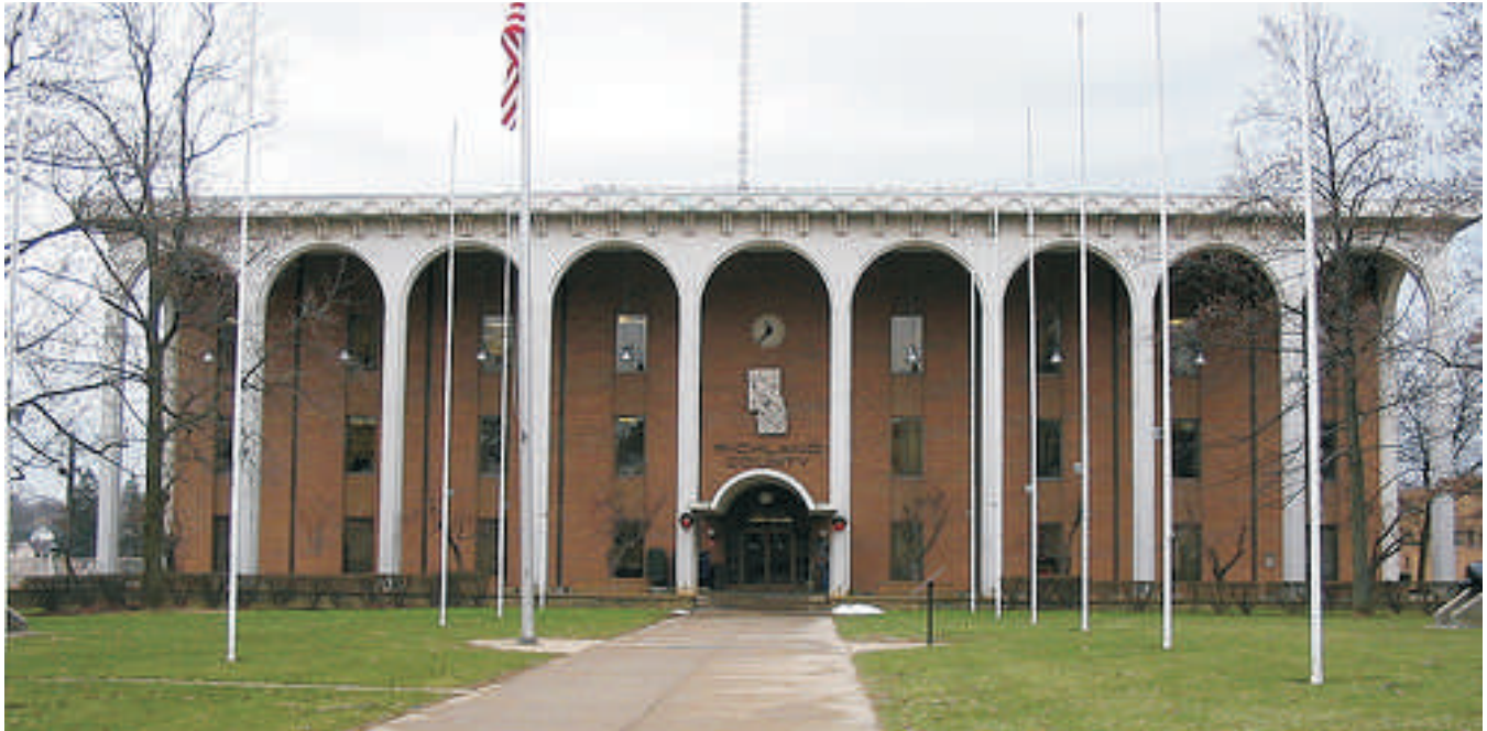
Richland County Courthouse, Mansfield.