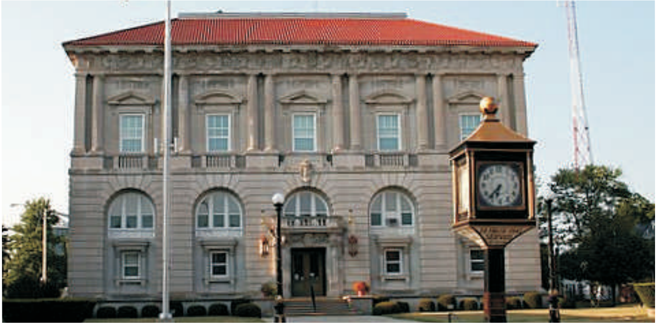
Putnam County Courthouse, Ottawa