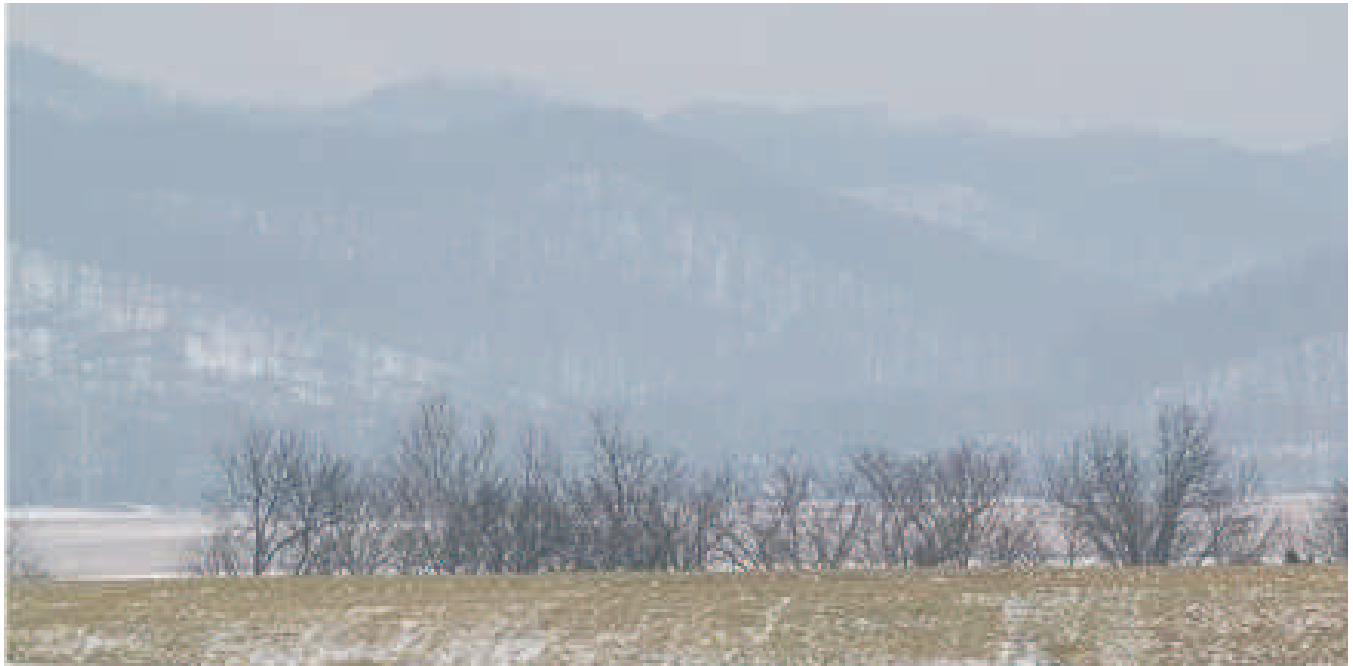
State Route 335, Waverly, Ohio.