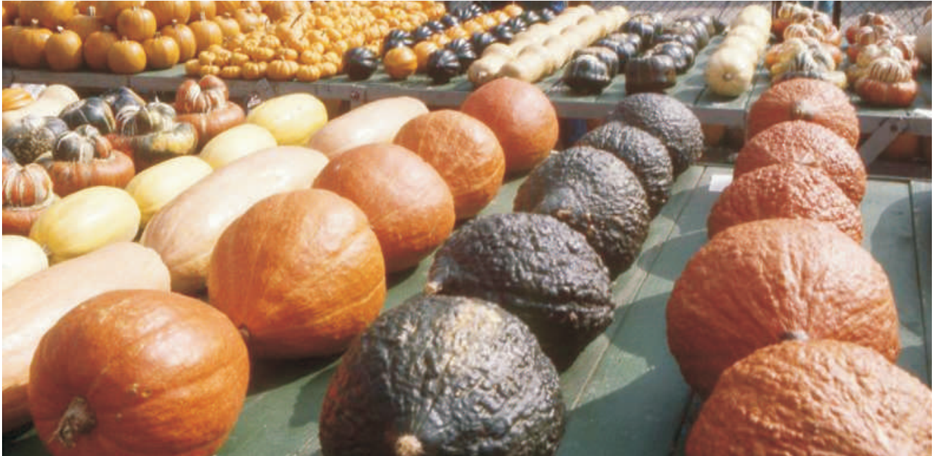
Circleville Pumpkin Festival.