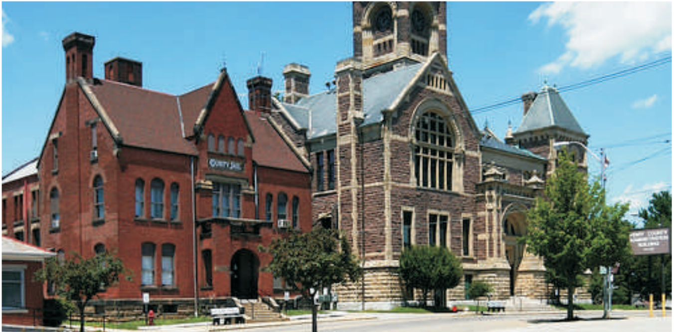
Perry County Courthouse and Jail, New Lexington.