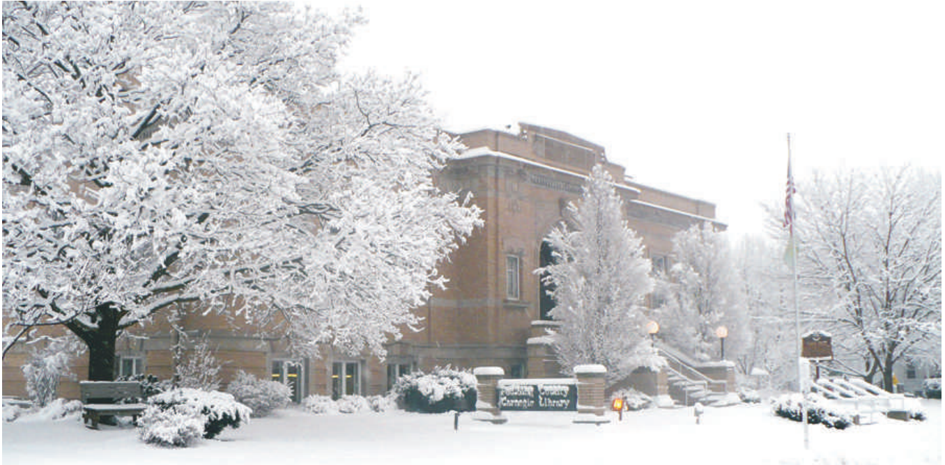
Paulding County Carnegie Library.