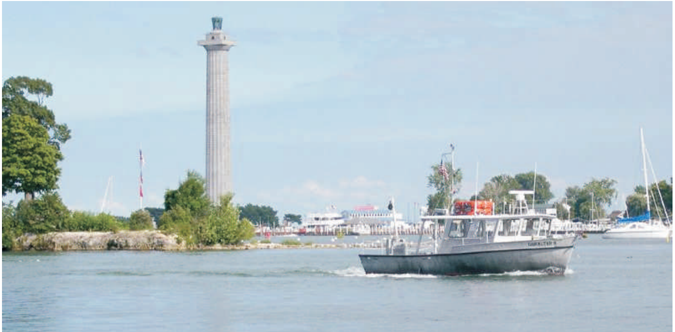
Perry Peace Memorial at South Bass Island State Park