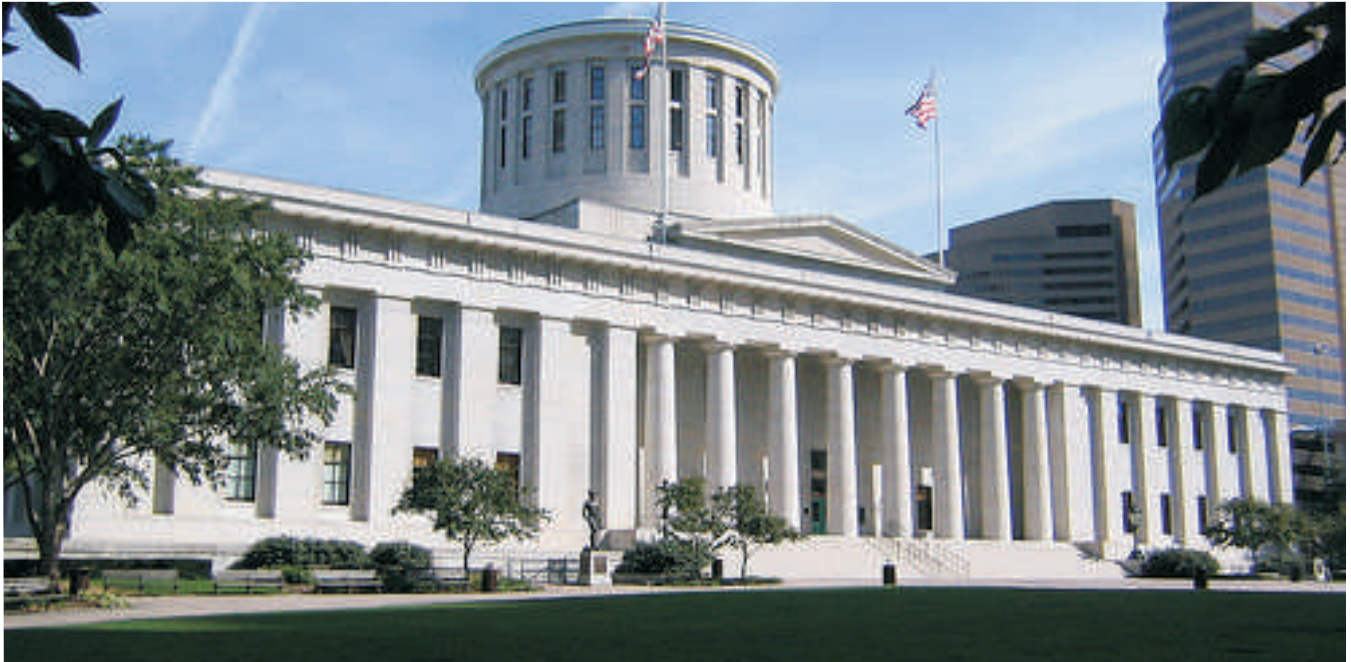
The Ohio Statehouse, Columbus