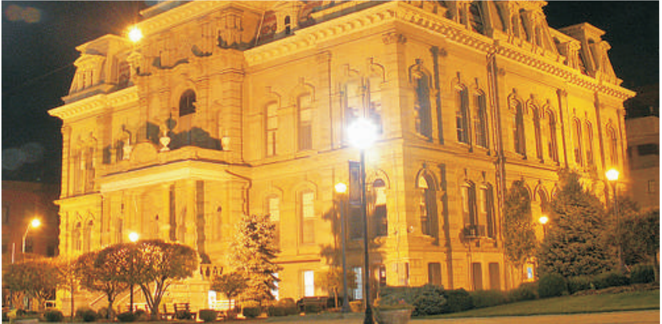
Muskingum County Courthouse