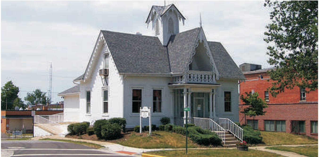
Library Annex in Mt. Gilead.