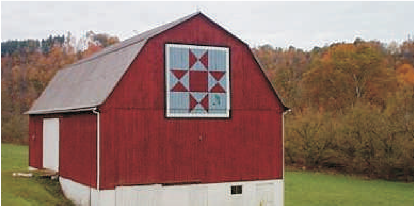
Ohio Star Quilt Barn.