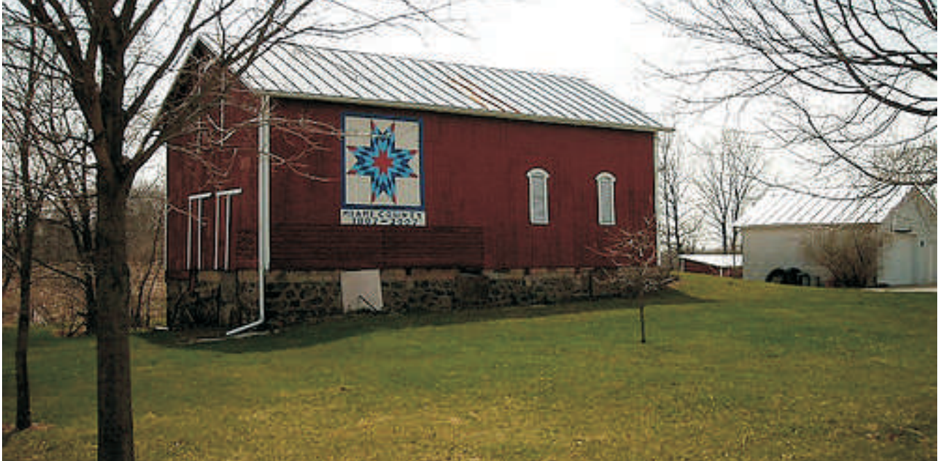
Duff Barn, State Route 55, Casstown.