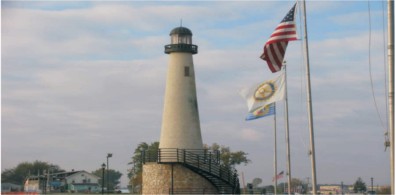
Grand Lake St. Mary's, Celina.