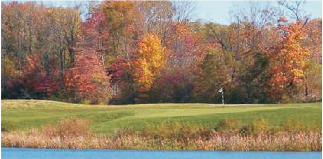
Medina County, Blue Heron Golf Course.