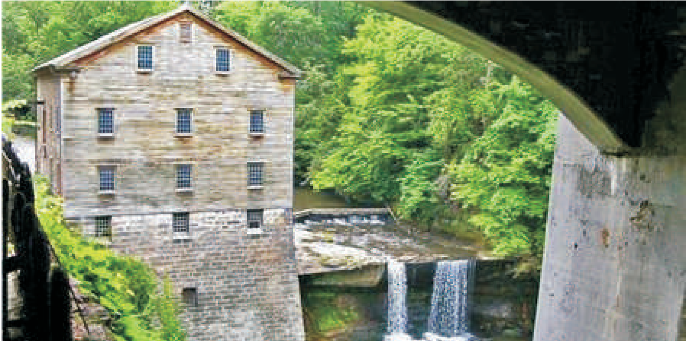
The Old Mill near Youngstown, Ohio.