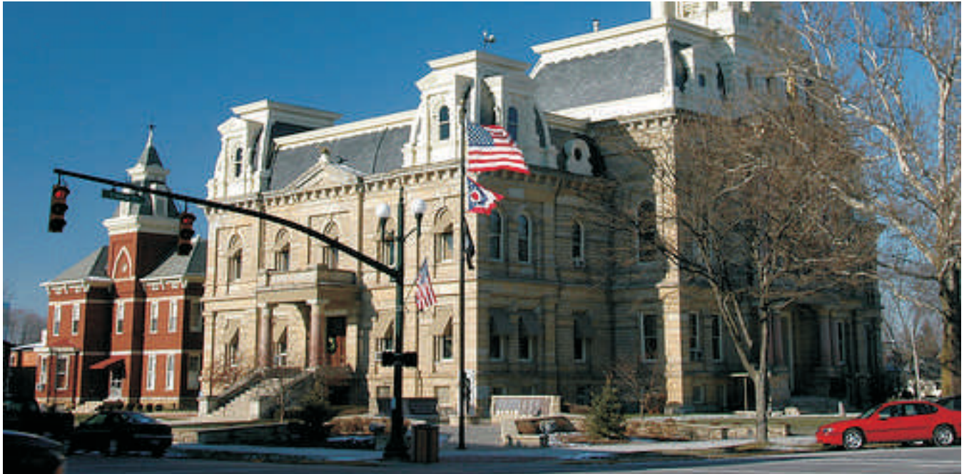
Madison County Courthouse, London