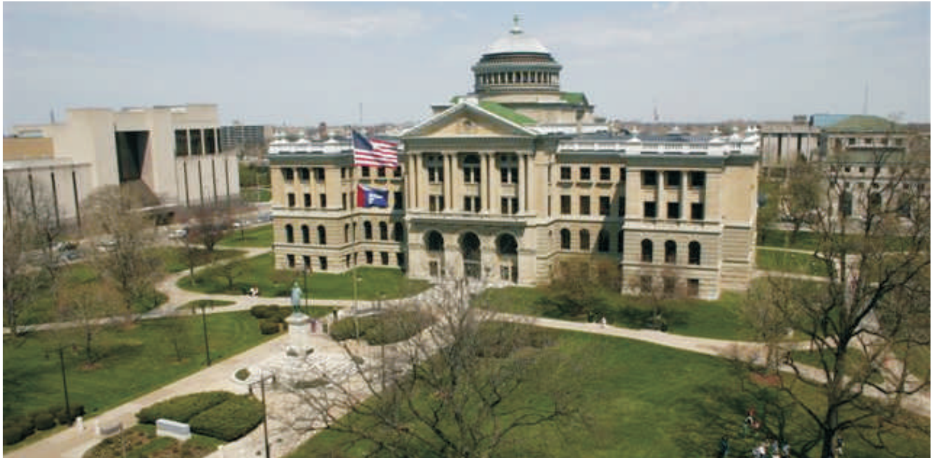
Lucas County Courthouse, Toledo