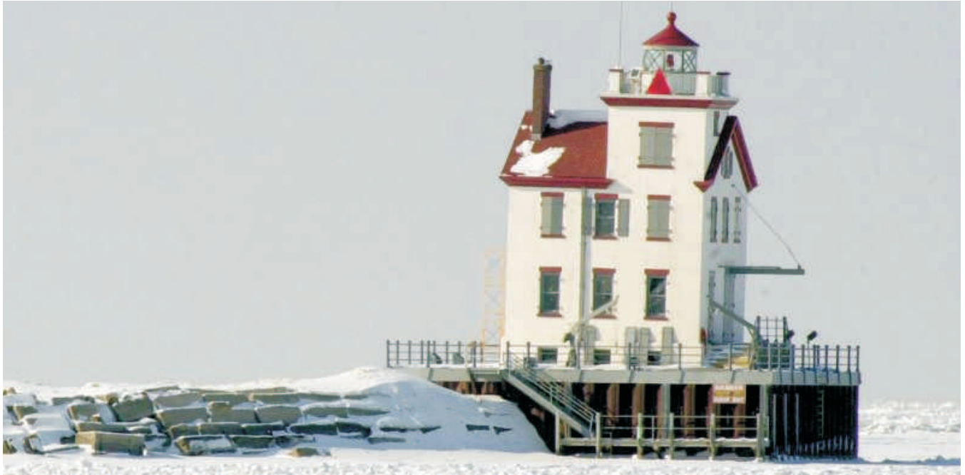
Lighthouse on Lake Erie