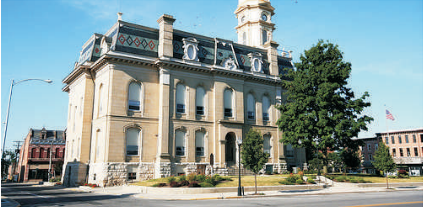
Logan County Courthouse, Bellefontaine.