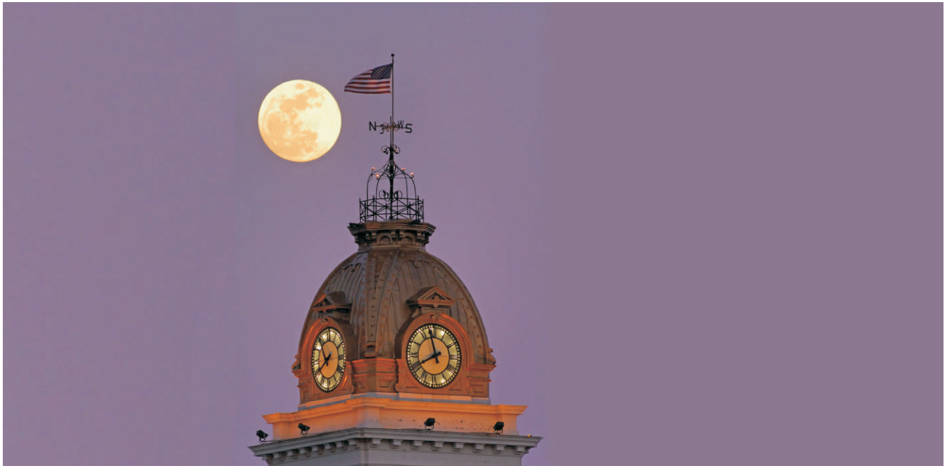
Moonrise. Licking County Courthouse, Newark.