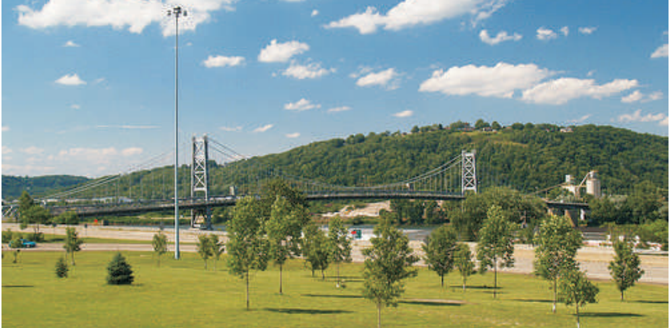
Bridge over the Ohio River at Steubenville