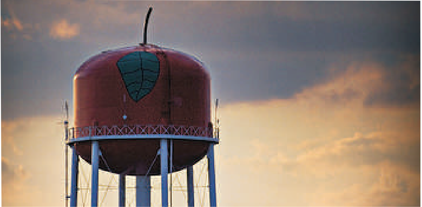
Apple Water Tower, Jackson