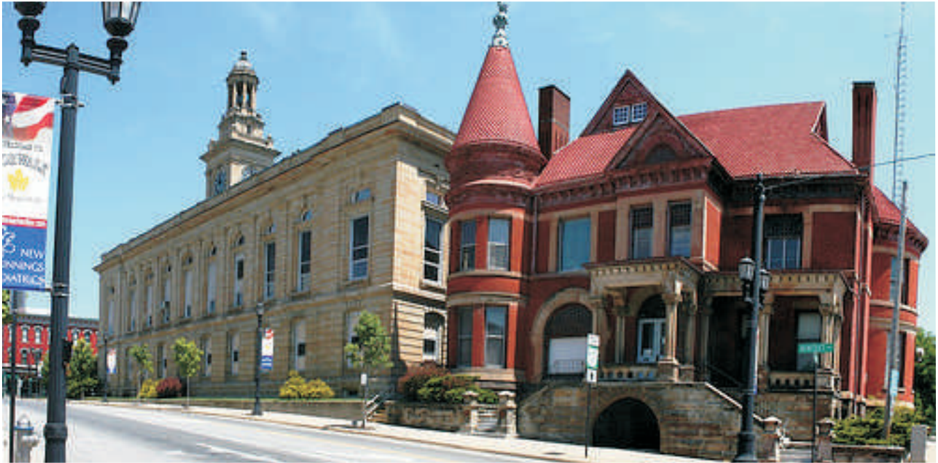
Huron County Courthouse, Norwalk.