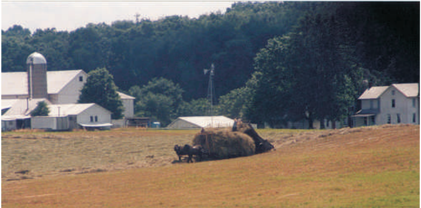
Amish farm harvest, Holmes County