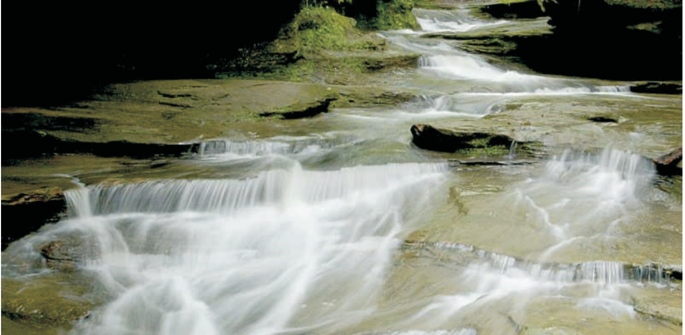
Old Man's Cave, Hocking Hills State Park