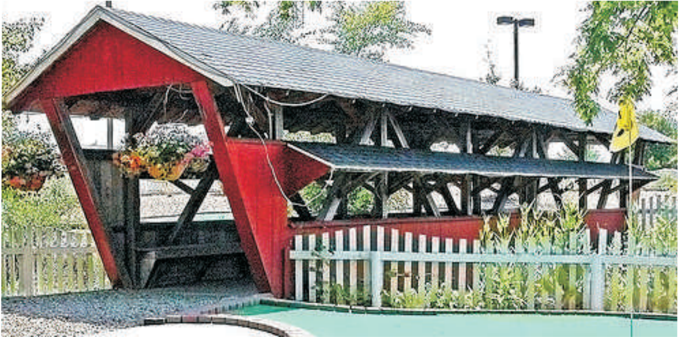
Hoagland Covered Bridge, east of Hillsboro