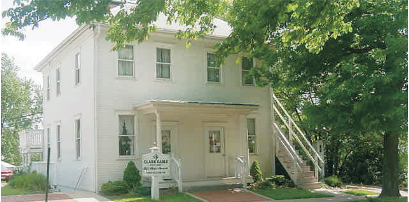
Clark Gable Monument and Museum, Cadiz