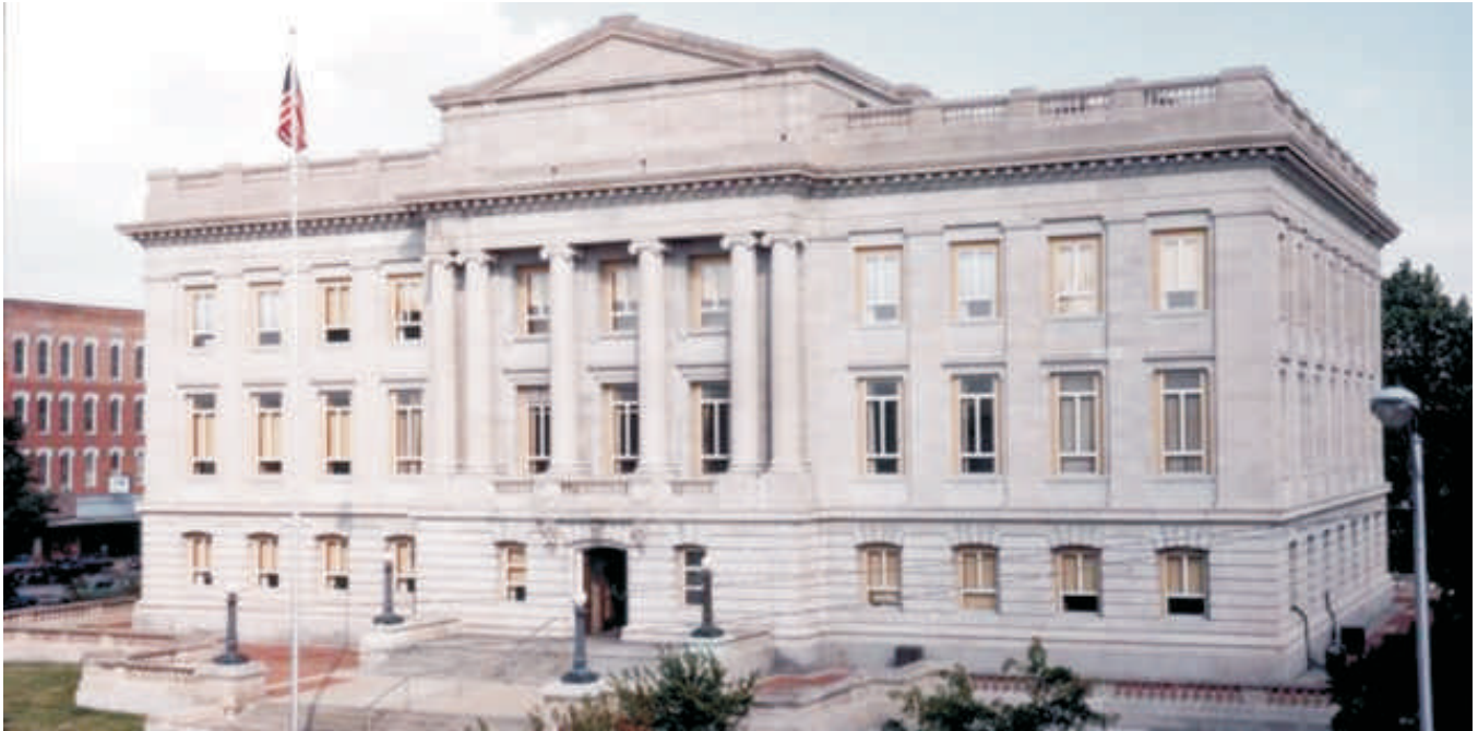
Hardin County Courthouse, Kenton