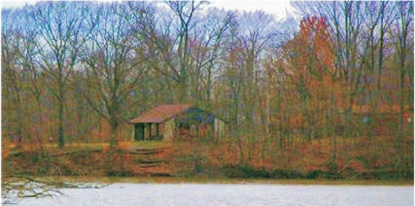
Shelter house at Van Buren State Park