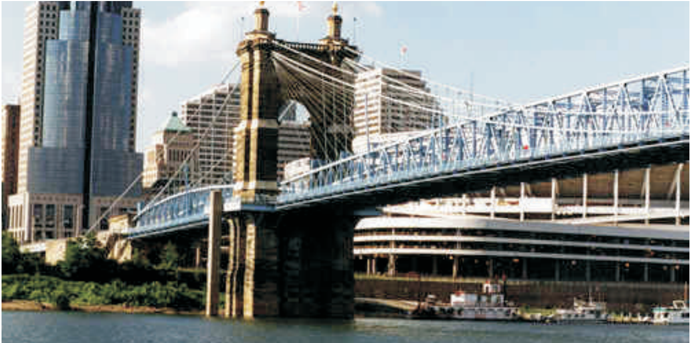
John A. Roebling Suspension Bridge, Cincinnati