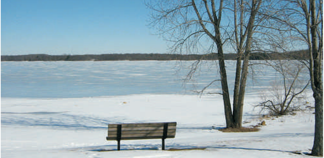
Alum Creek Lake, Delaware.