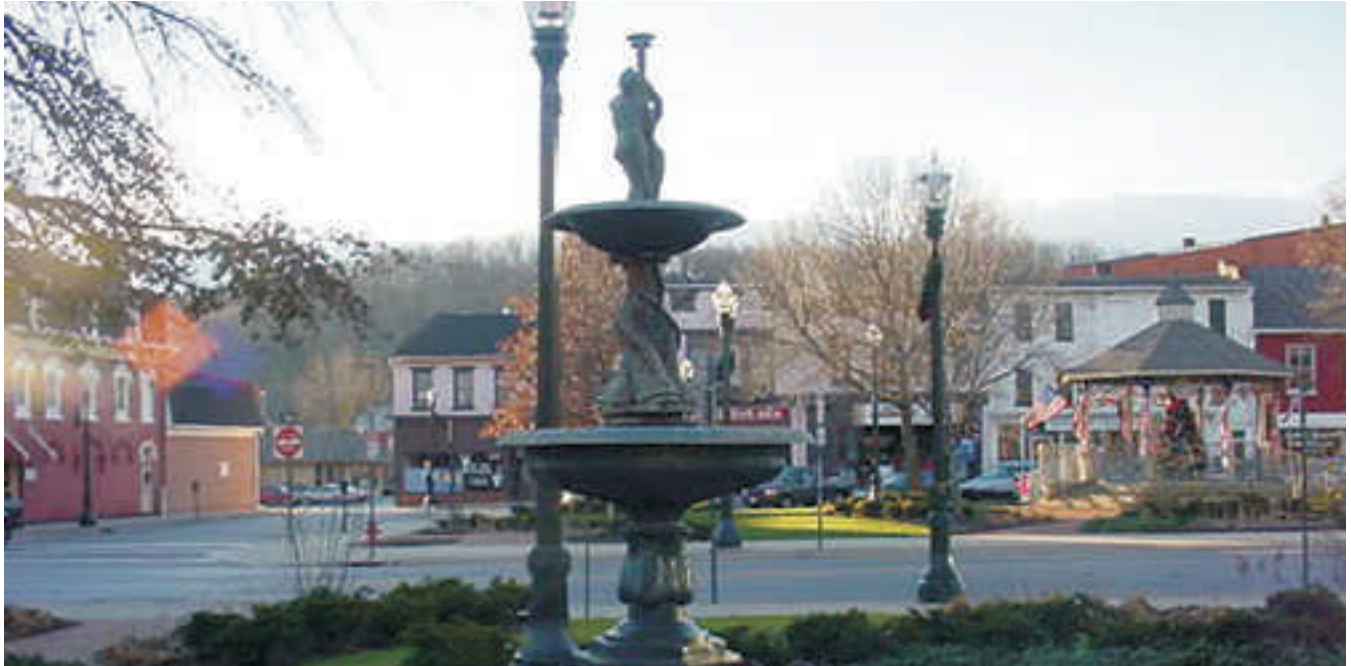
Town Square, Lisbon