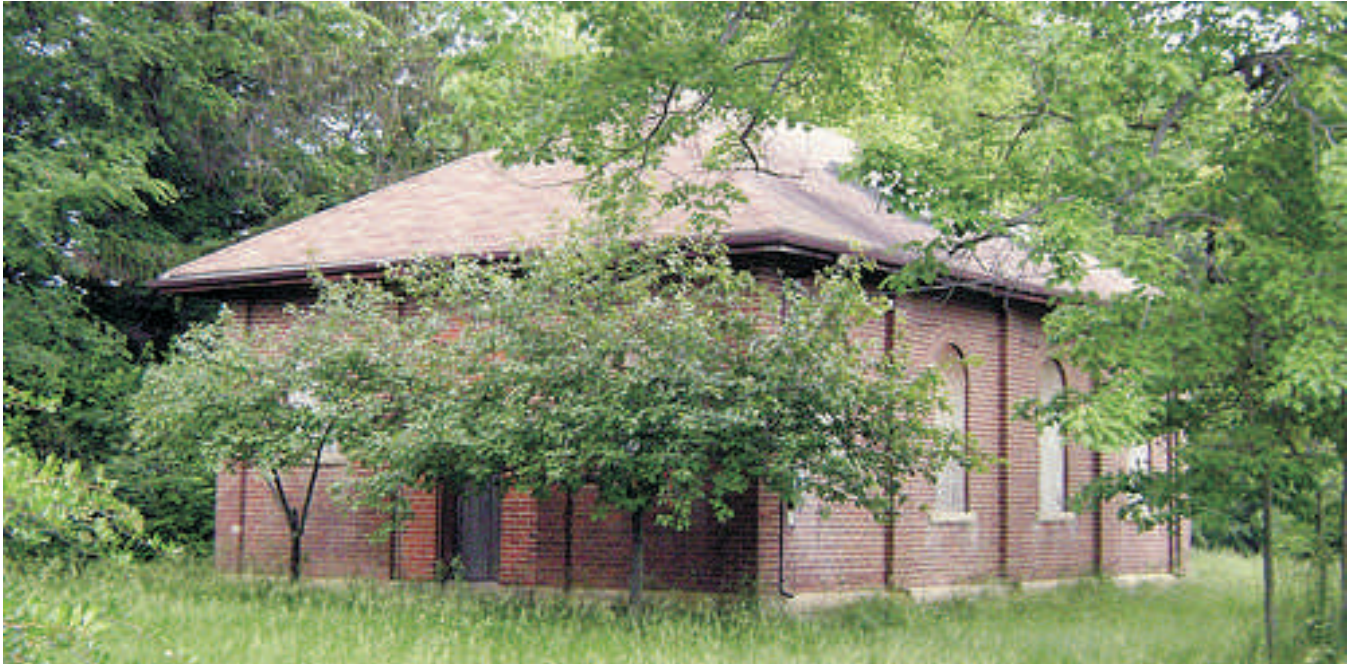
The Huber School, Route 131 between Chasetown and Harwood, Perry Township