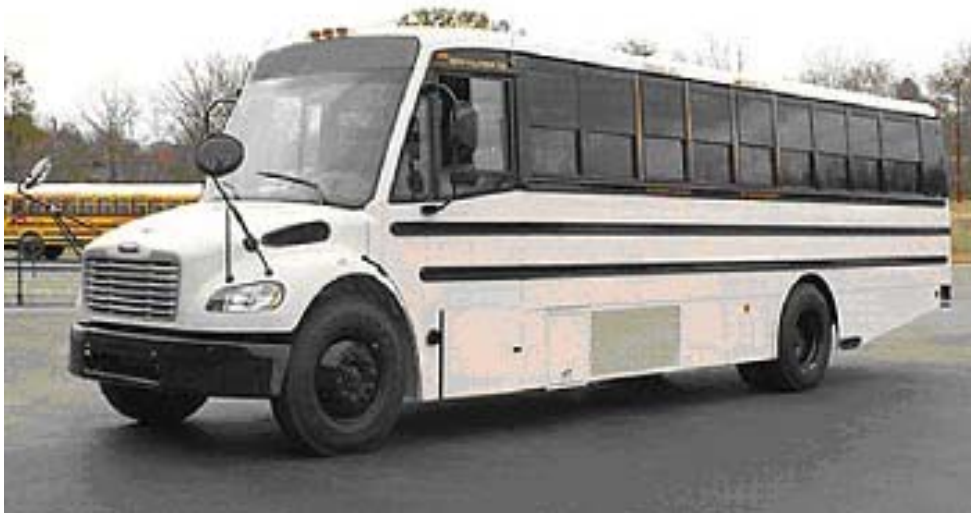
Large School Bus