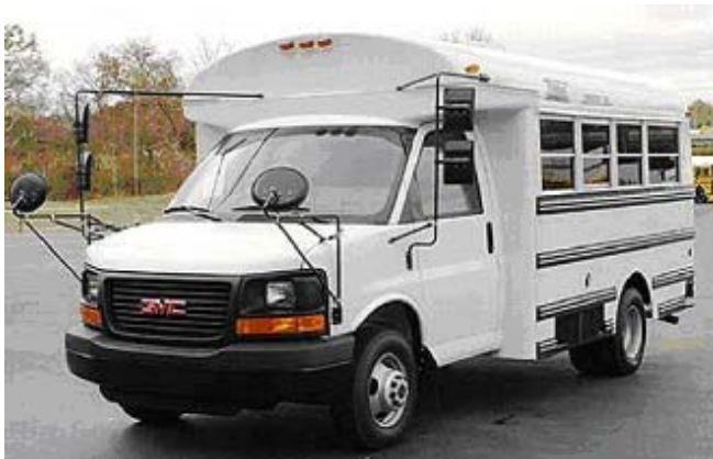
Multifunction School Activity Bus (“MFSAB”)

The “Multifunction School Activity Bus” (MFSAB) is designed to provide all of the crash safety standards that are found on a traditional school bus, but without the stop-sign arm and warning lights that traditional school buses need for frequent pick-up and drop-off at school bus stops. Thus, the vehicles in this category conform with all FMVSS requirements for school bus structural and crash standards, but are not required to have specialized warning devices such as stop signs and warning lights, and they are not required to be painted a specific color (i.e. school bus yellow).