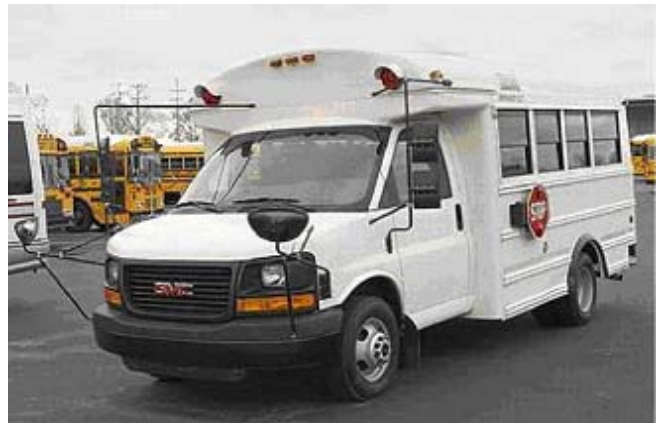
Small School Bus

Both of these vehicles meet FMVSS standards and look very similar. The only significant difference between these vehicles is that the MFSAB does not have the warning lights and a stop arm.