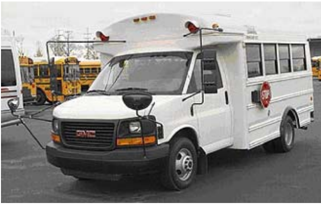
Small School Bus