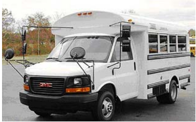
Multifunction School Activity Bus

Note: As illustrated above, a child care vehicle does not have to be painted school bus yellow (it can be yellow, but it does not have to be yellow). Ohio is still working on clarifying this requirement in law and rules.