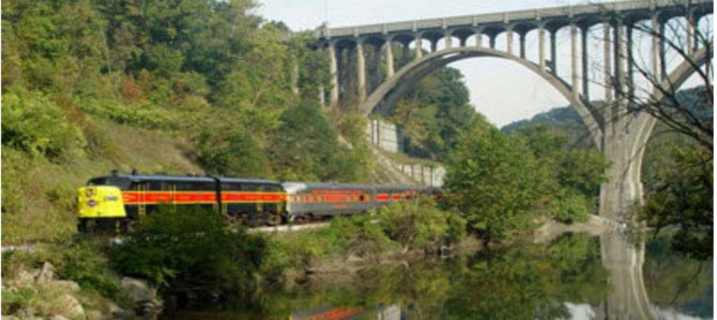
Cuyahoga Valley National Park