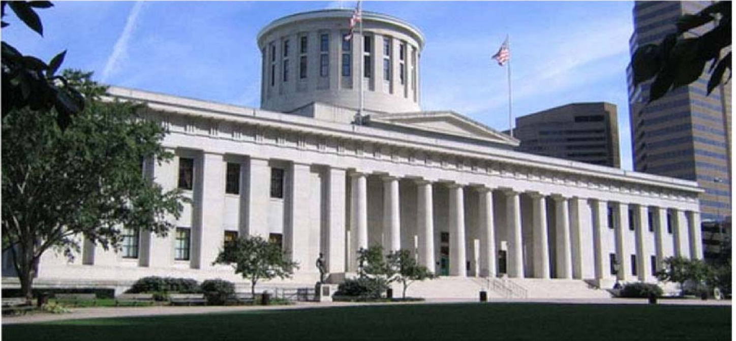
The Ohio Statehouse, Columbus